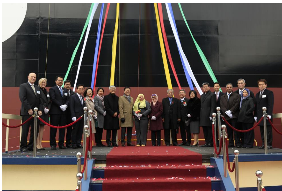
The Naming and Delivery Ceremony of Seri Camar at the HHI Shipyard in Ulsan, South Korea

The vessels have been awarded the Green Passport Notification and with an extended low-load gas mode meaning that they can operate entirely on LNG for full compliance with existing and impending Sulphur Emissions Control Area (SECA) regulations.